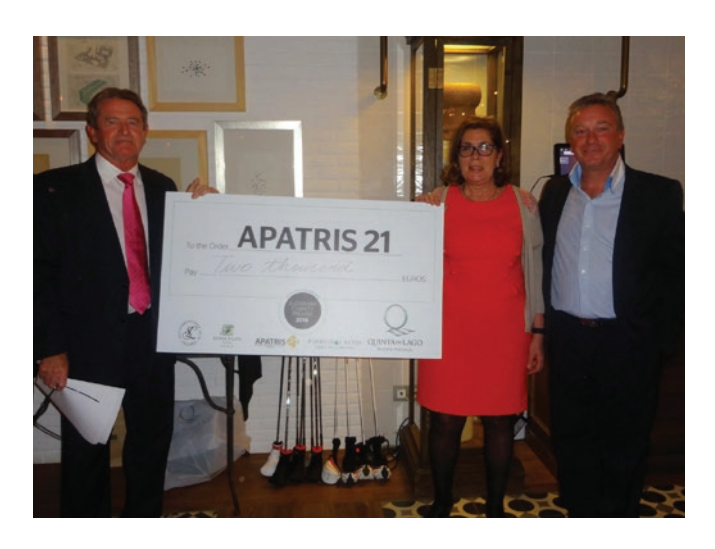
Cheque for €2000 being Presented to the Charity Apatris 21

I wish you all a great start to the Golf Season and look forward to seeing many of our members during the Easter break!