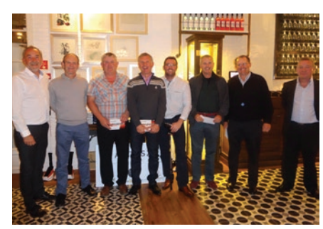
Winners of the Optional Day at Laranjal